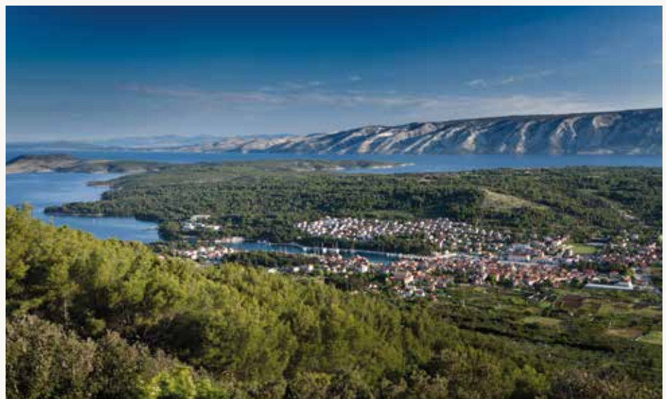
Stari Grad, Hvar

All of our services and experiences are subject to change based on availability and seasonality.