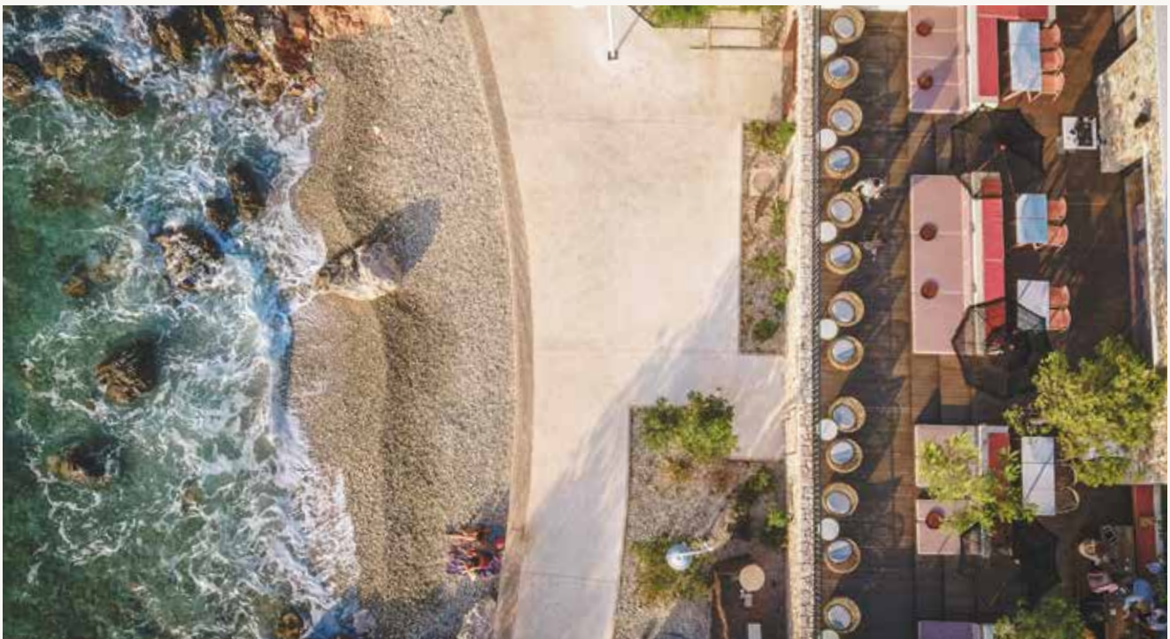
A-Bay Beach Bar

The Organic Beach Garden includes a fine-pebbled beach for guests with a private sunbathing area. Our organic and aromatic garden grows to feed our kitchen and spa.