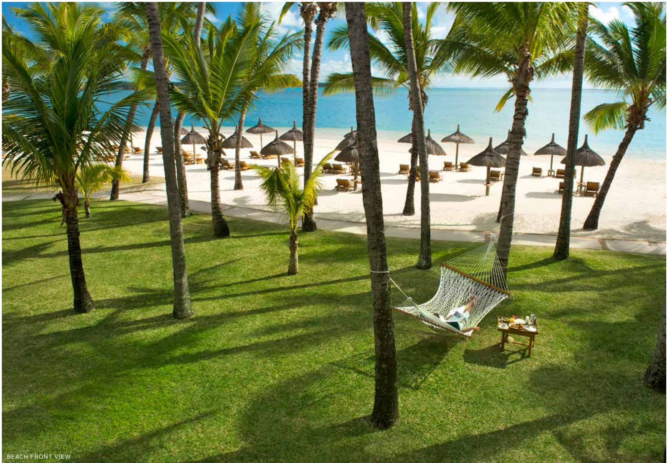
BEACH FRONT VIEW