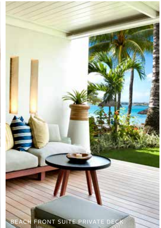
BEACH FRONT SUITE PRIVATE DECK