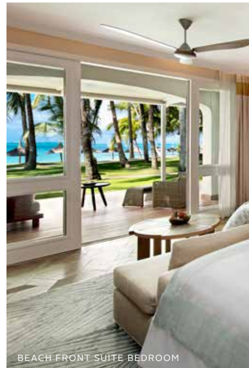
BEACH FRONT SUITE BEDROOM

A cool, contemporary beach-inspired aesthetic in hues of sun-bleached sand and ocean blue is brought alive with vibrant blooms in spaces of effortless beauty – the spirit of Mauritius echoes throughout. Endless views, secluded indoor and outdoor spaces and lofty marbled bathrooms opening onto generous dressing rooms and tranquil terraces create a perfect sanctuary and a timeless sense of home.