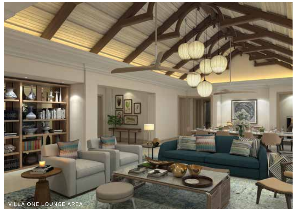
VILLA ONE LOUNGE AREA