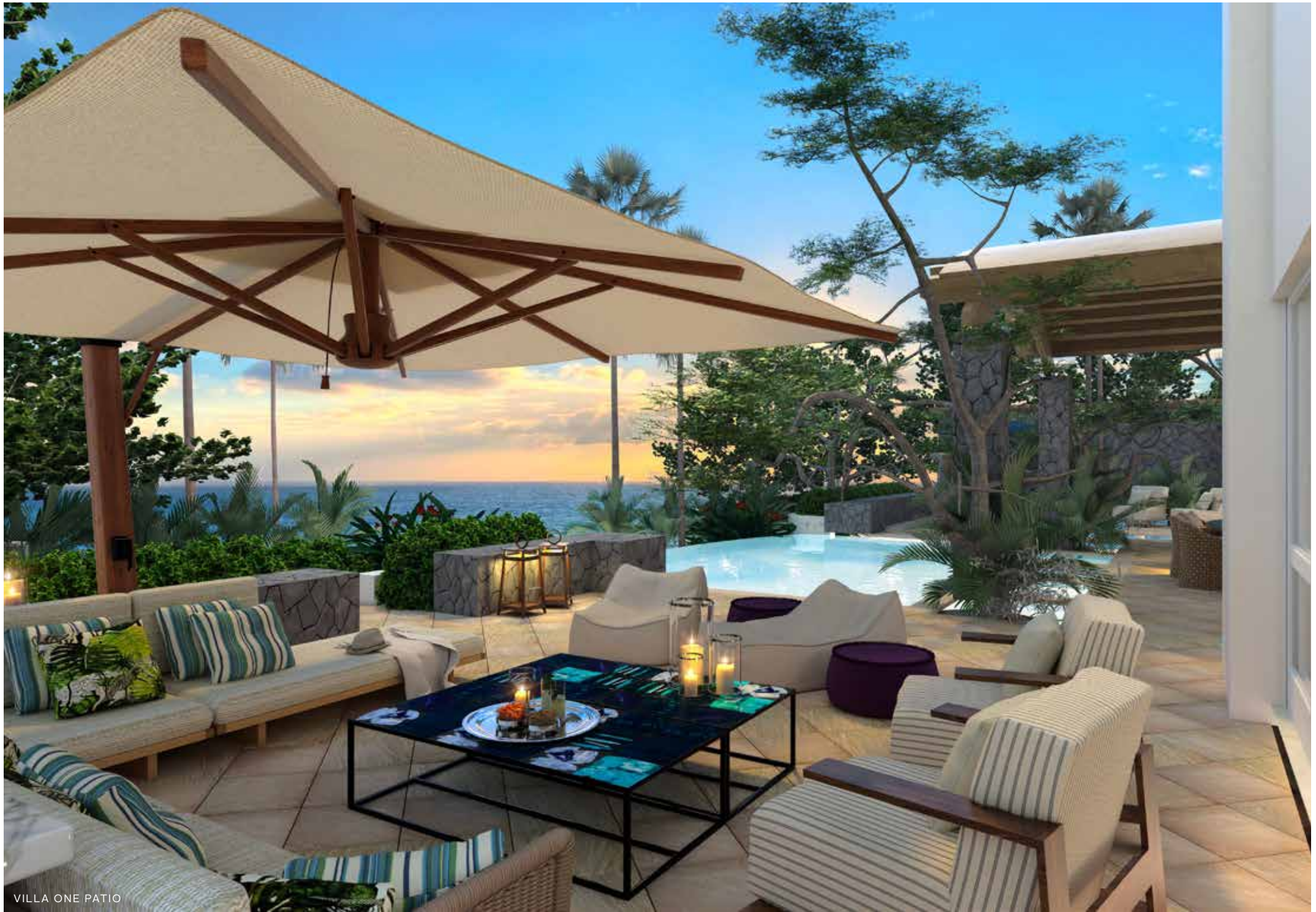
VILLA ONE PATIO