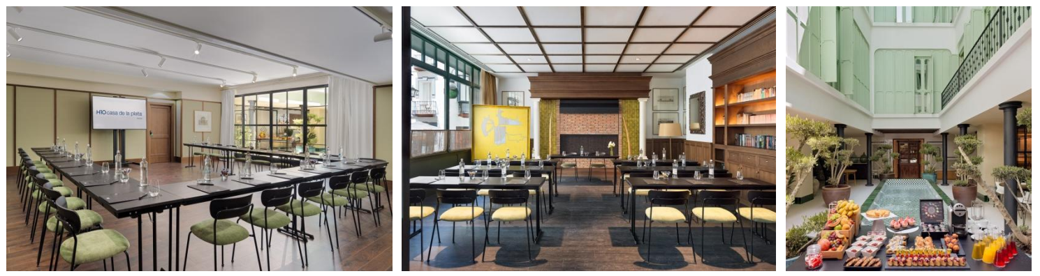
COLÓN ROOM – U-SHAPE LAYOUT

* The calculation of the capacity is approximate and subject to change. For more details consult the sales department of the hotel.