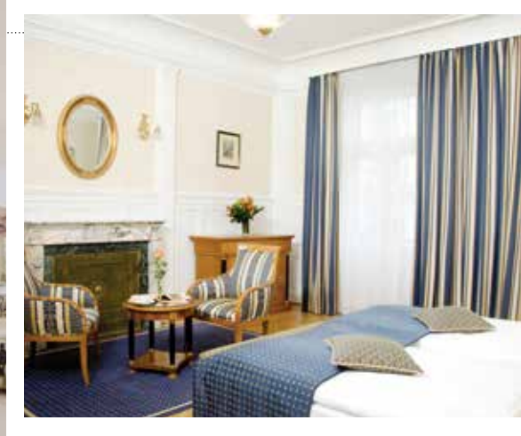
Free WiFi access in all rooms!