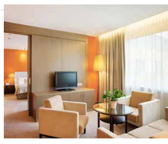
Free WiFi access in all rooms!