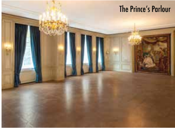
The Prince's Parlour