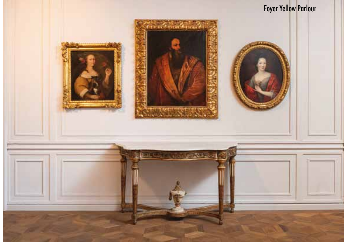
Foyer Yellow Parlour