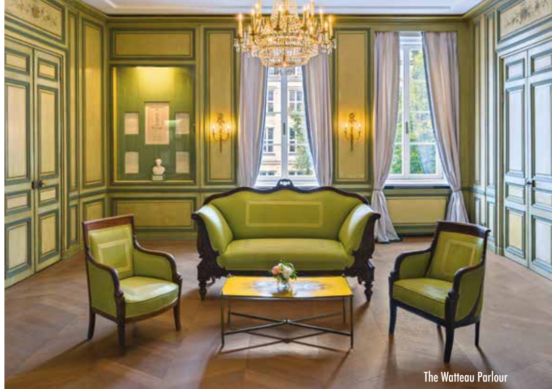
The Watteau Parlour