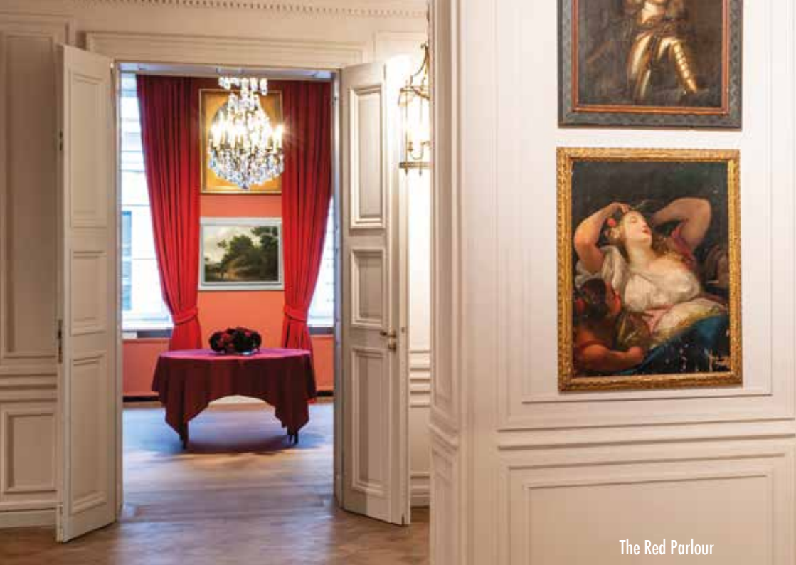
The Red Parlour