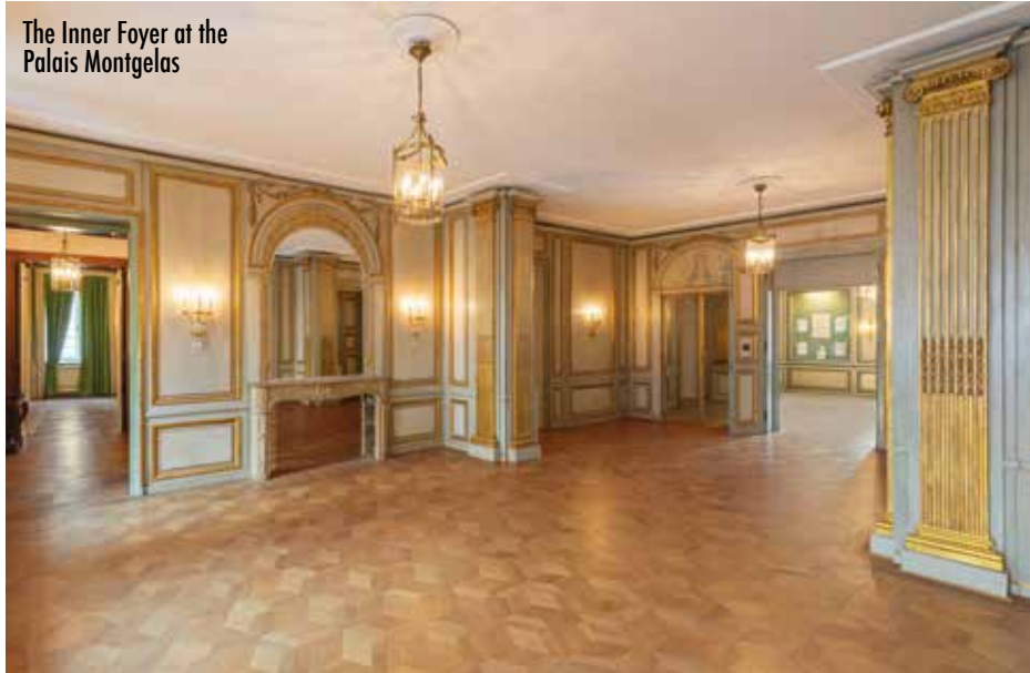
The Inner Foyer at the Palais Montgelas

different parlours were given individual colours like “Babouche”, “Picture Gallery Red” or “Stone Blue”.