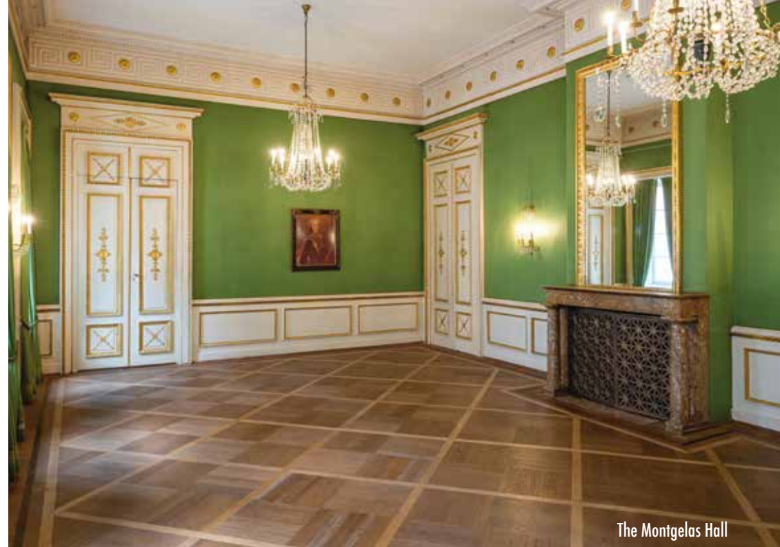
The Montgelas Hall

A magnificently adorned room in the style of Louis XV with ceiling-high mirrors and elaborate stucco in gold and white. History was written in this impressive, listed hall, including the coronation of Maximilian III as elector.