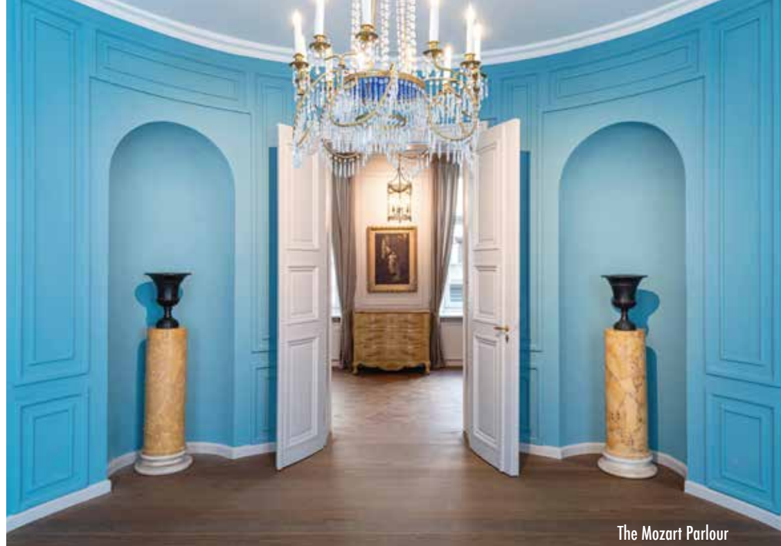
The Mozart Parlour