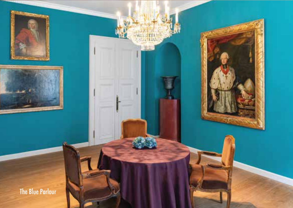
The Blue Parlour