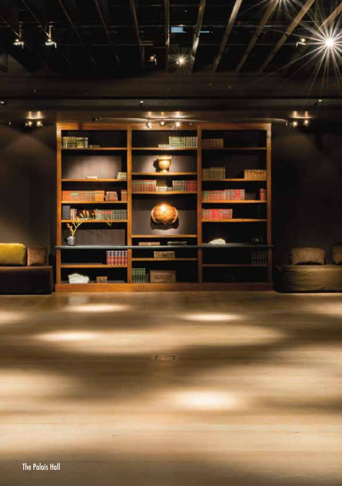
The Palais Hall