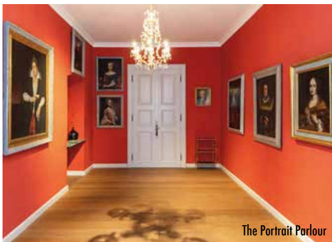
The Portrait Parlour

The vibrant red tone on the walls, accentuated by various works of art, including a 18th century portrait of a bourgeois woman of