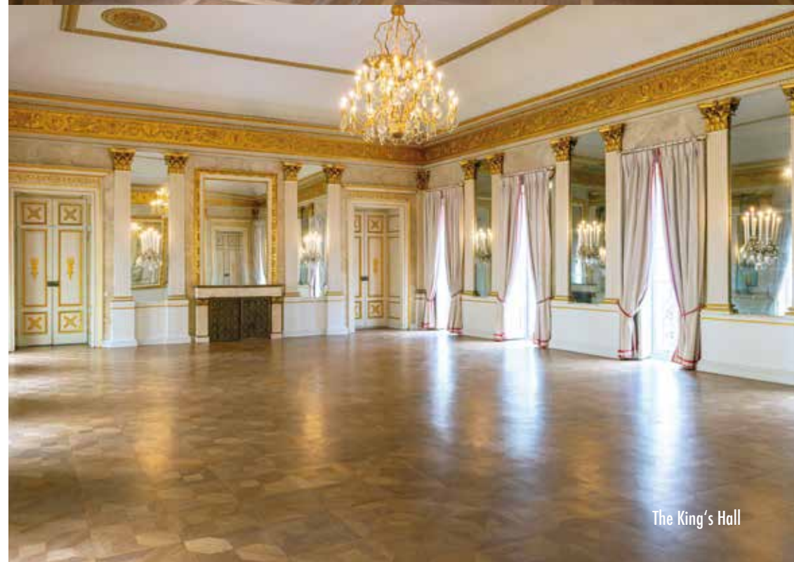
The King’s Hall