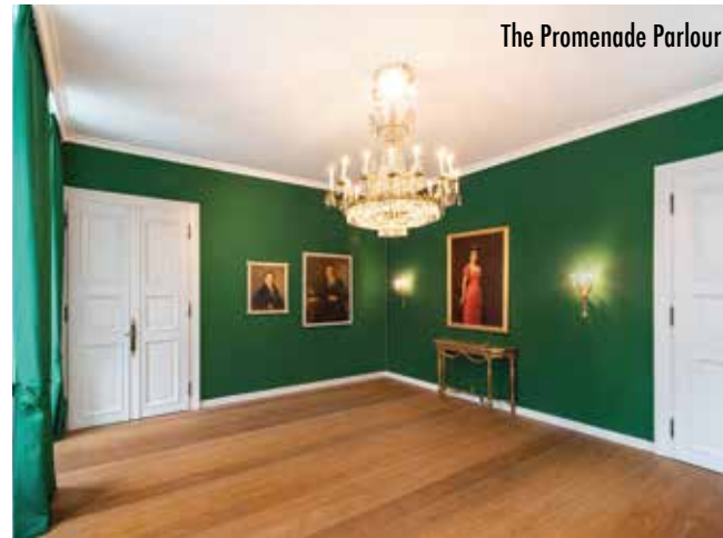
The Promenade Parlour