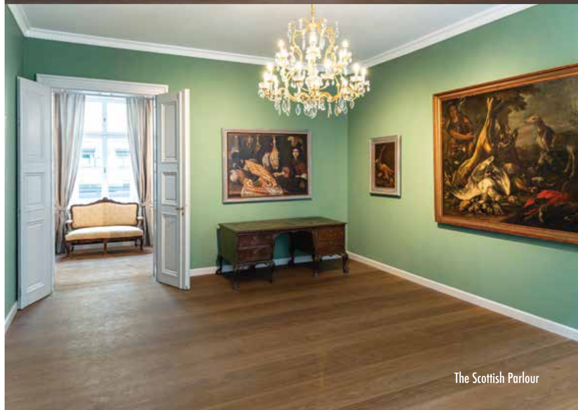
The Scottish Parlour