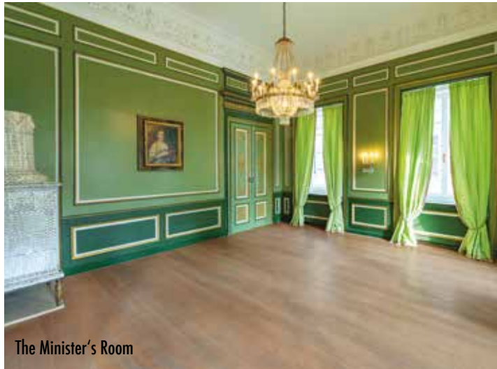
The Minister's Room

The 14 event rooms steeped in history in the historic part of the Palais Montgelas were renovated by Axel Vervoordt with care and love. In doing so, the carpeted flooring in all of the rooms was replaced with parquet flooring, all walls were given a new colour design and all existing wood panelling and art works, steeped in history, were