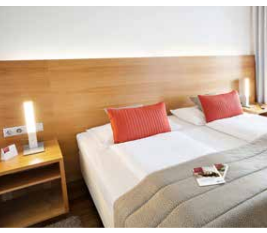
Free WiFi access in all rooms!