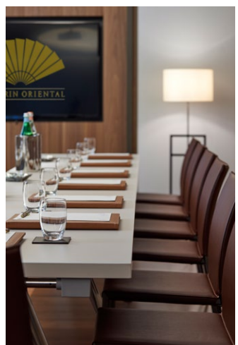
With an excellent location in the city's centre, Mandarin Oriental, Milan offers first class business services, catering, and technology ready facilities.